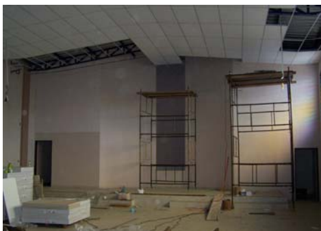
Pictured Left: Inside of the new church and its continual progress church toward completion in Brazil.