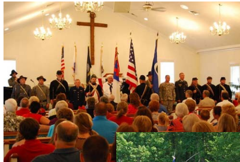
Pictured Right: A 21 gun salute on the church grounds following the meal honors veterans and those currently serving in the military.

was given on the church grounds following the meal to honor veterans and those currently serving in the military.