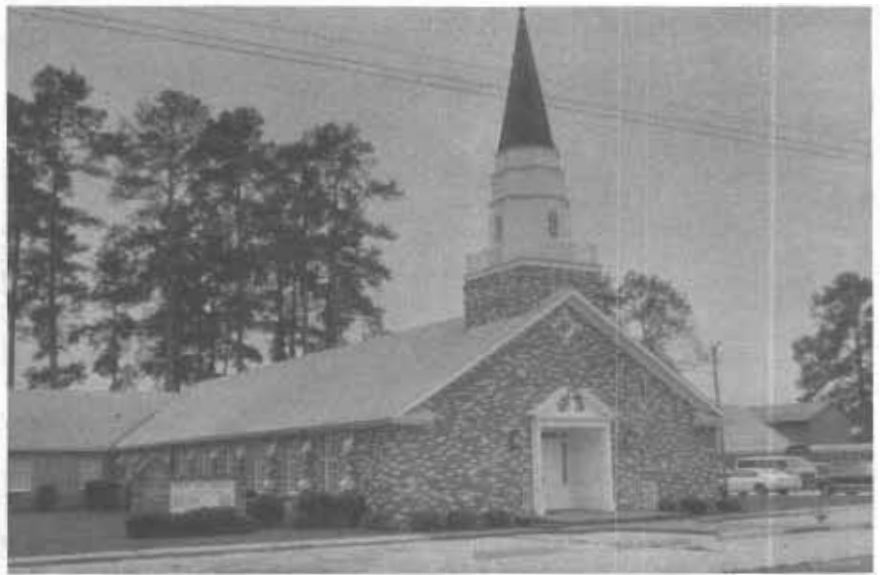
New Prospect FWB Church and School Facilities