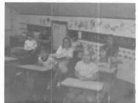
Grades 2-3-4 Classroom