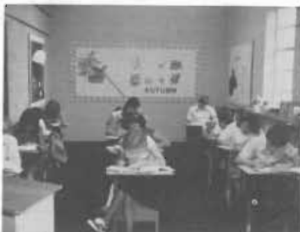
Grades 7-8-9-10 Classroom