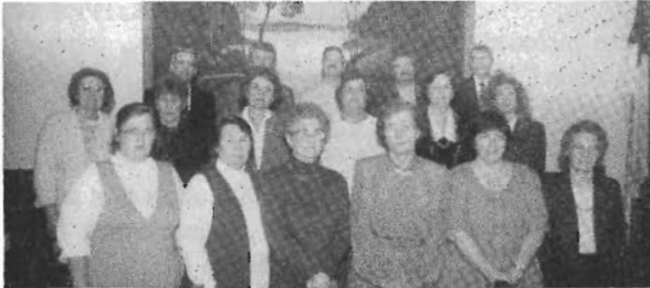
Bible Readers Club Members